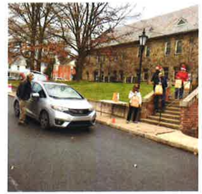
Handing out goods purchased through the ACGB website