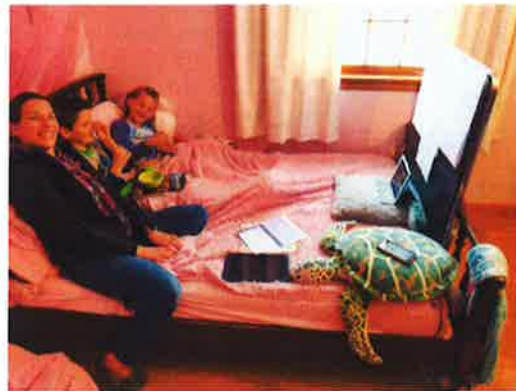
Practicing for the virtual Christmas Pageant