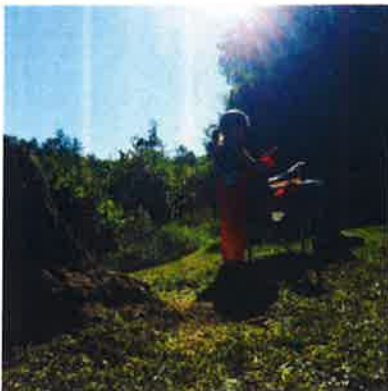
Visiting safely outside

2020 forced us to remember - to reimagine - who we are, beyond our building. We found strength and resilience we didn't know we had. I look forward to the New Year with its new beginnings. I look forward to gathering with you all again, face to face in the sacred space of our sanctuary. I look forward to the choir sounding forth, and to good meals shared around tables. But I will remember this past year, and the character of this Stone Church family that shined through the challenges. Through it all, you have shown how much you truly care for each other, for this community, and for the ministry to which we are called - proclaiming good news and continuing the work of Jesus - peacefully, simply, and together.