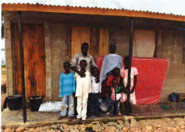
Displaced family moving into their new home.

Our church family gave generously and we were able to send $3,546.00 to help our sisters and brothers in Nigeria.