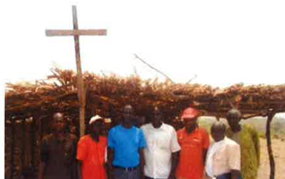
Temporary Church at Masaka village for displaced families.