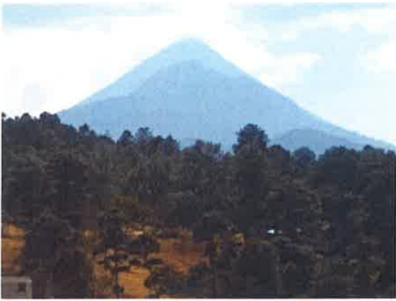
A view of the majestic Santa María volcano, seen behind La Muela (The Molar) ridge from La Cruz (The Cross) scenic overlook in Salcajá.