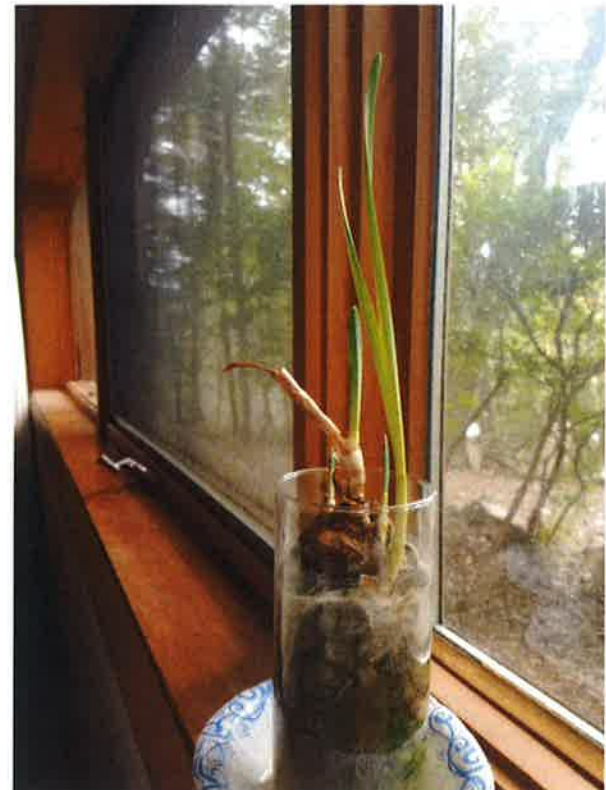
Picture from October 13 th , 2021 when the bulb started to sprout.

I had given up on that dead bulb. I was convinced it was doomed to death. It stood sadly on the windowsill - more proof of my lack of a green thumb. Months went by and I neglected to throw it out. And yet despite the months of dormancy, despite my disbelief, despite its glum, brown appearance... the bulb sprouted. I had believed it to be numb, burned out and incapable of reaching for hope. Turns out it just needed some patience. And for the sun to hit it Close to Home , reminding it to grow.