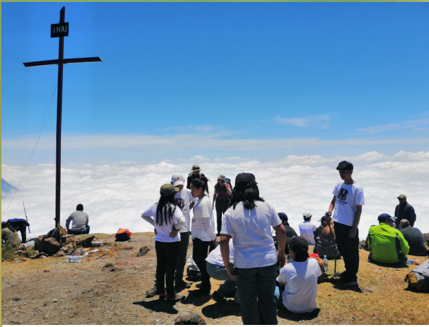
View from the summit of the Santa María volcano

Please contact me if you would like additional information on these options, and it is possible and encouraged to participate in more than one program if it works for your schedule. The projected cost for the Guatemala delegations is $1,800 for adults, $1,600 for college students, and $1,400 for children and youth, which includes round-trip airfare and the basic in-country expenses of transportation and room & board. The cost for each additional program is only $400, and any surplus funds go to support our Guatemalan partner school.