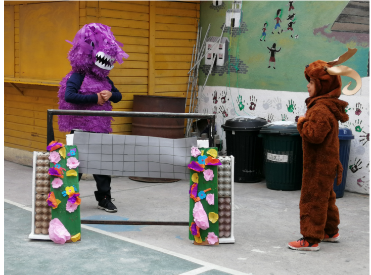
Culminating activity for the environmental stewardship theme

Each month has a foundational theme such as health and wellbeing, the environment, sustainable economic development, and gender equality, and now that classes are in person, our partners have been able to resume culminating activities at the end of each month: a visit to a rural health center, planting seedlings in a nearby valley, a panel discussion on corruption, democracy, and socio-economic differences in preparation for the upcoming presidential election, etc. They also resumed the annual school field trip for the first time since 2019, this year to the indigenous ruins of Iximché and to various cultural venues in the historic colonial capital of Antigua, as well as the annual trek up the Santa María volcano and the celebration of the school's anniversary the first week in August, complete with the election of study government officers, soccer and basketball tournaments, and artistic presentations and food delivery at a residential facility for impoverished senior women.